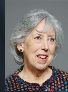
Baroness Eliza Manningham-Buller