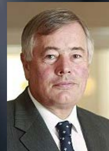
LIFETIME ACHIEVEMENT Sir Nigel Rudd